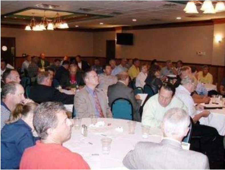
Approximately 60 construction industry leaders attended the joint Alliances Meeting.